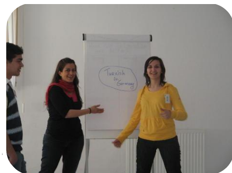
Participants presenting the results of a workshop

After getting to know each other and getting an introduction to the topic, the participants defined migration as "the movement of people across state borders for a myriad of reasons, except for vacation". This definition would serve as a basis for the work of the coming days. In the course of the seminar the participants went on to look closer on different topics related to migration, such as the human rights aspect or FRONTEX (the EU agency for external border security). Every participant informed the others about the migration situation in their home countries and guest speaker Bashy Quraishy, president of ENAR (European Network Against Racism), gave them an insight into the situation in Denmark and shared his views on migration, or "mobility"- as he prefers to call it. Finally there was time to develop personal action plans on how to use the knowledge gained on the seminar in the work of YFU national organisations. The seminar and especially the efforts of the organising team were highly appreciated by the participants, of whom many will have the possibility to pass on what they learned to the participants of the YES 2008 as workshop leaders.